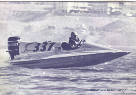
The all new 16-foot Sprint.

CHECKMATE BOATS • BOX 723 • BUCYRUS, OHIO 44820